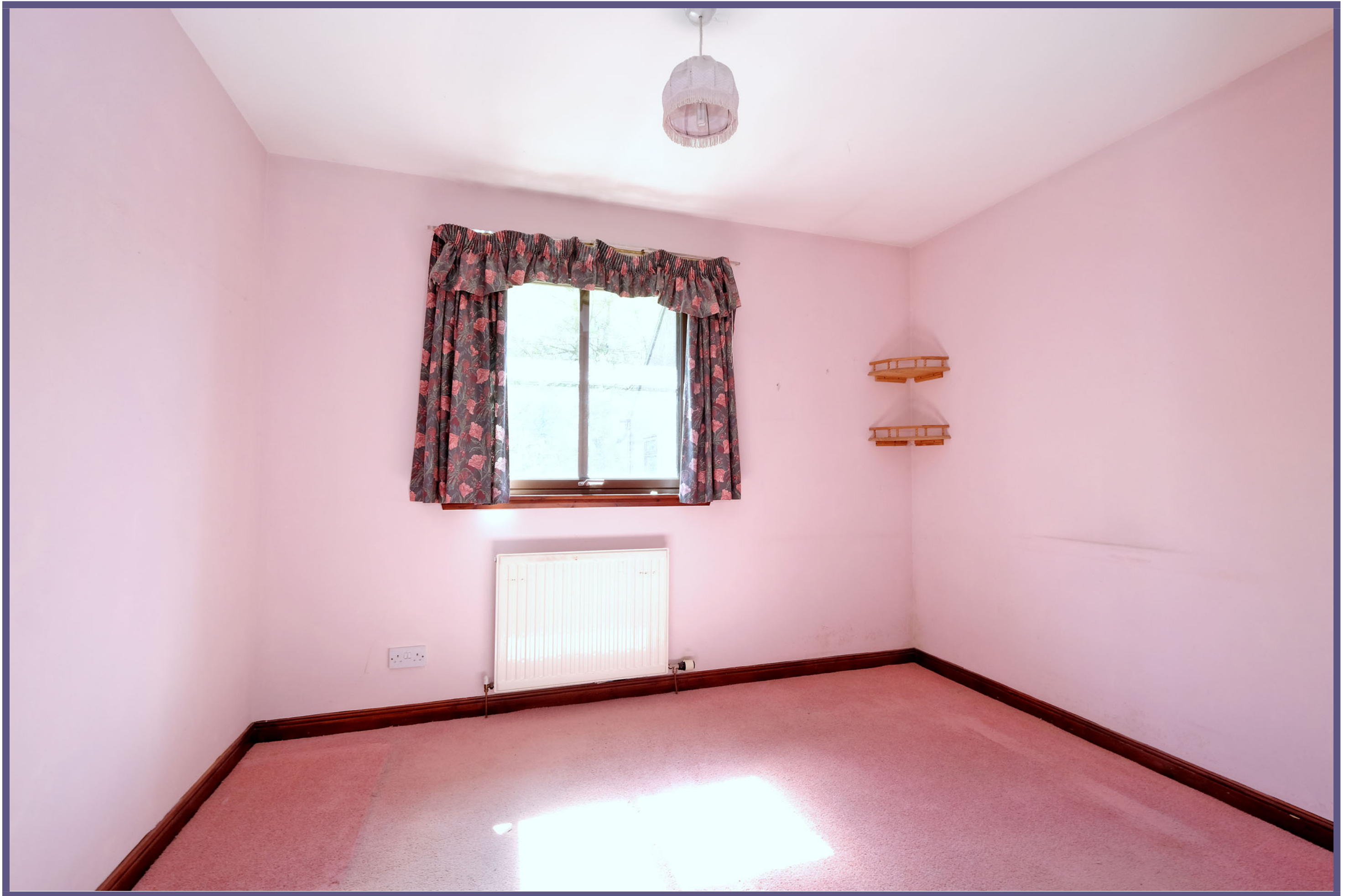
Double Bedroom 2