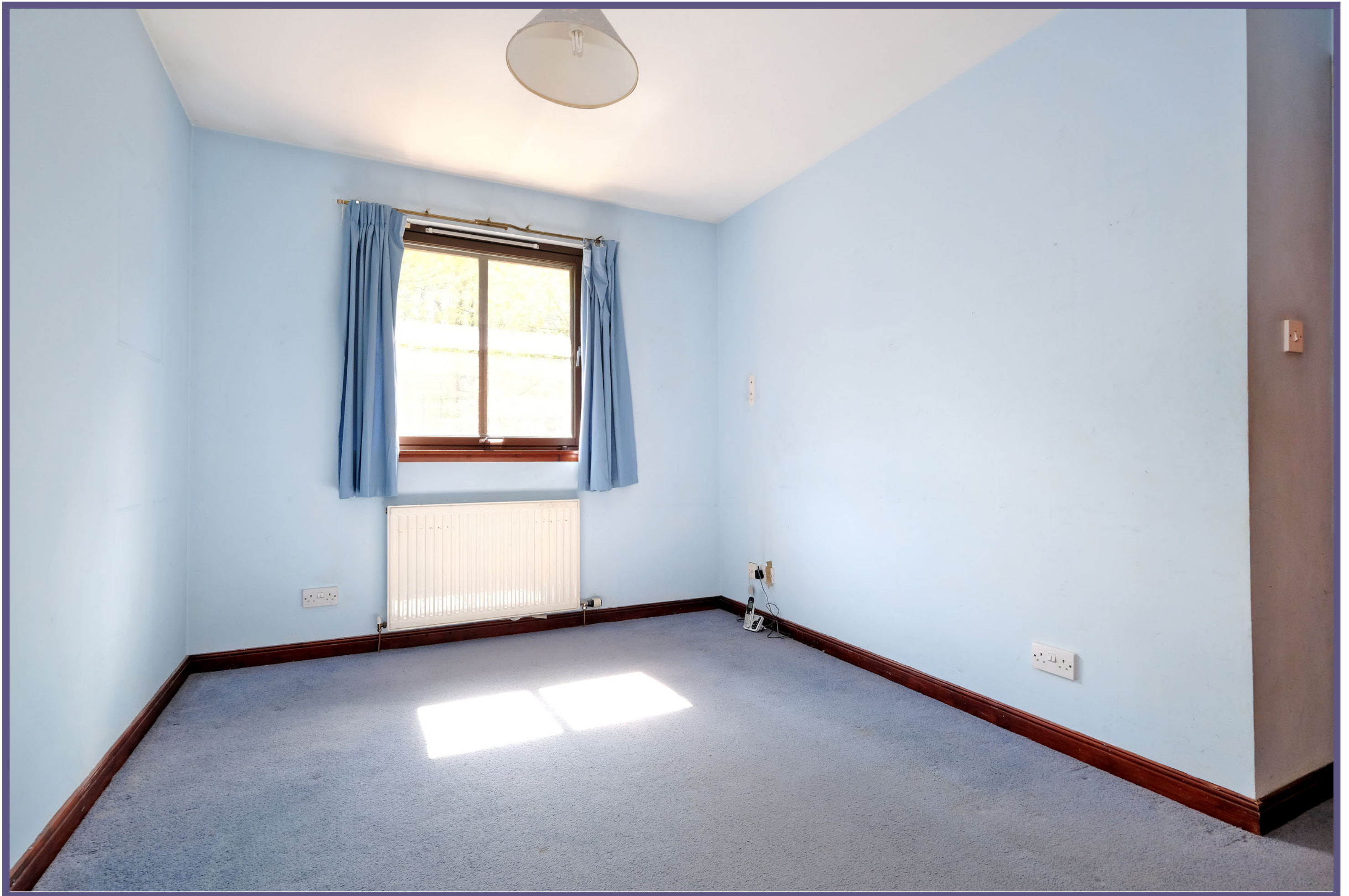
Double Bedroom 1