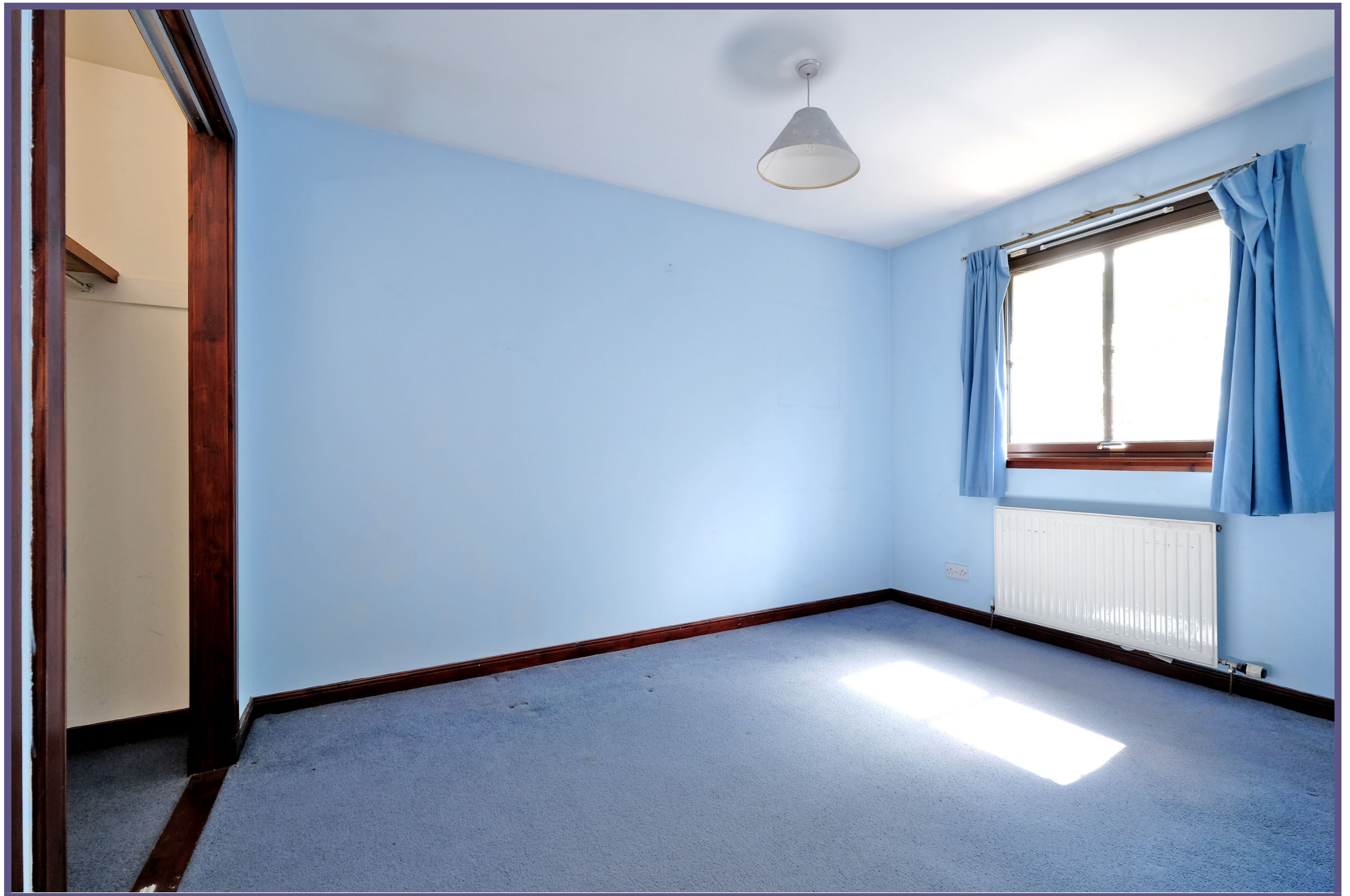
Double Bedroom 1